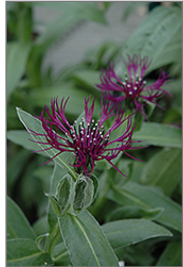
Amethyst Dream Cornflower flowers