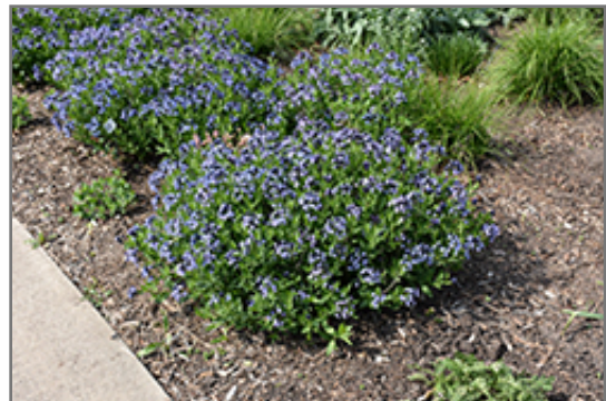
Blue Ice Star Flower in bloom