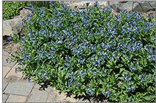
Blue Ice Star Flower in bloom

This plant does best in full sun to partial shade. It prefers to grow in average to moist conditions, and shouldn't be allowed to dry out. It is not particular as to soil type or pH. It is quite intolerant of urban pollution, therefore inner city or urban streetside plantings are best avoided. This is a selection of a native North American species. It can be propagated by cuttings; however, as a cultivated variety, be aware that it may be subject to certain restrictions or prohibitions on propagation.