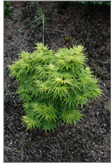
Mikawa Yatsubusa Japanese Maple

Mikawa Yatsubusa Japanese Maple is a fine choice for the yard, but it is also a good selection for planting in outdoor pots and containers. With its upright habit of growth, it is best suited for use as a 'thriller' in the 'spiller-thriller-filler' container combination; plant it near the center of the pot, surrounded by smaller plants and those that spill over the edges. It is even sizeable enough that it can be grown alone in a suitable container. Note that when grown in a container, it may not perform exactly as indicated on the tag - this is to be expected. Also note that when growing plants in outdoor containers and baskets, they may require more frequent waterings than they would in the yard or garden.