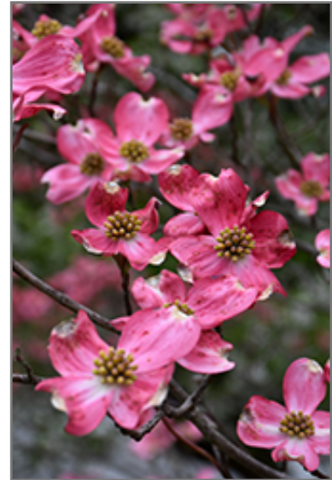
Cherokee Chief Flowering Dogwood flowers

This is a relatively low maintenance tree, and usually looks its best without pruning, although it will tolerate pruning. It is a good choice for attracting birds to your yard. Gardeners should be aware of the following characteristic(s) that may warrant special consideration;