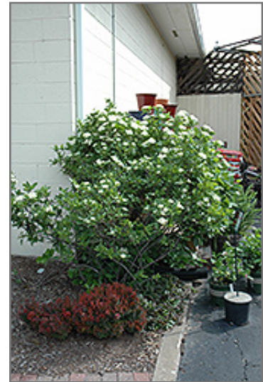
Winterthur Viburnum in bloom