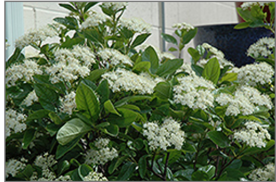
Winterthur Viburnum flowers

This is a relatively low maintenance shrub, and should only be pruned after flowering to avoid removing any of the current season's flowers. It is a good choice for attracting birds to your yard, but is not particularly attractive to deer who tend to leave it alone in favor of tastier treats. It has no significant negative characteristics.