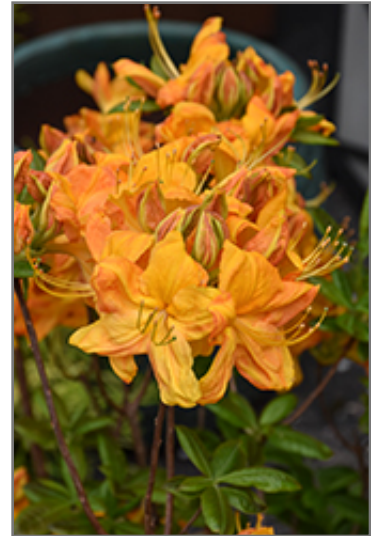
Klondyke Azalea flowers