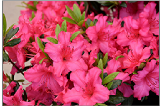
Girard's Rose Azalea flowers