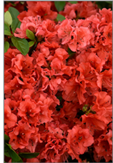
Girard's Hot Shot Azalea flowers