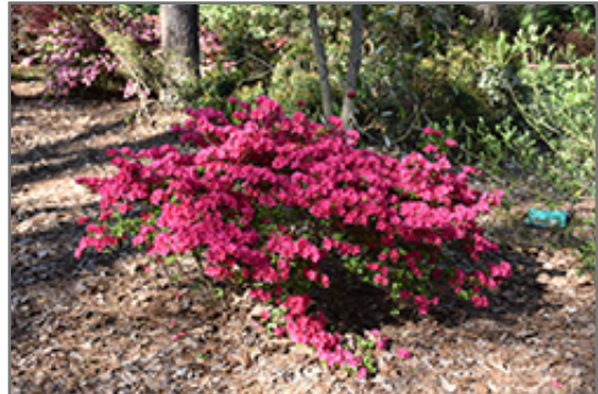
Girard's Fuchsia Evergreen Azalea in bloom