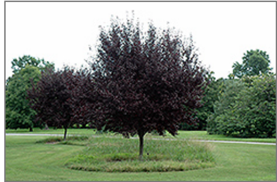
Krauter Vesuvius Plum

Krauter Vesuvius Plum will grow to be about 20 feet tall at maturity, with a spread of 12 feet. It has a low canopy with a typical clearance of 4 feet from the ground, and is suitable for planting under power lines. It grows at a medium rate, and under ideal conditions can be expected to live for approximately 30 years.