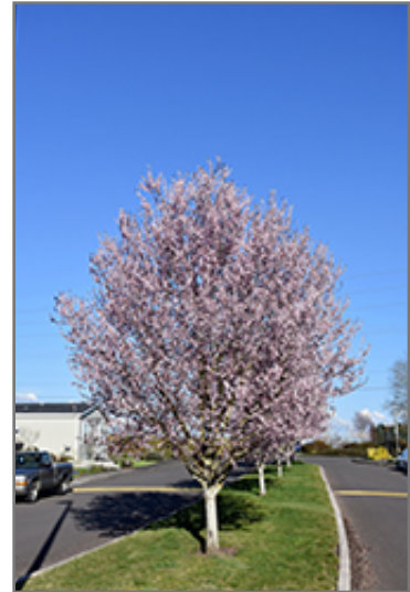
Krauter Vesuvius Plum in bloom

This tree will require occasional maintenance and upkeep, and is best pruned in late winter once the threat of extreme cold has passed. It is a good choice for attracting birds to your yard. Gardeners should be aware of the following characteristic(s) that may warrant special consideration;