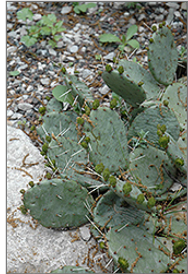
Eastern Prickly Pear Cactus