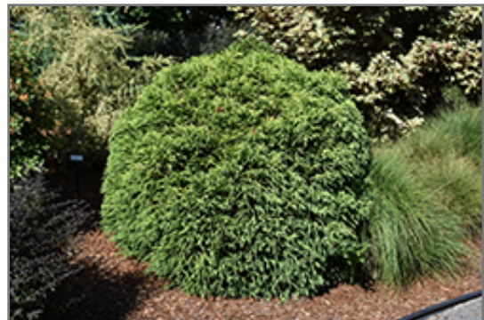
Dwarf Globe Japanese Cedar