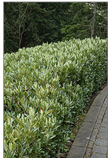
Otto Luyken Dwarf Cherry Laurel in bloom