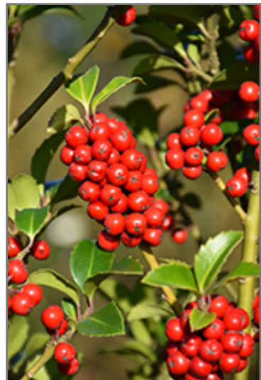
Castle Spire Meserve Holly fruit