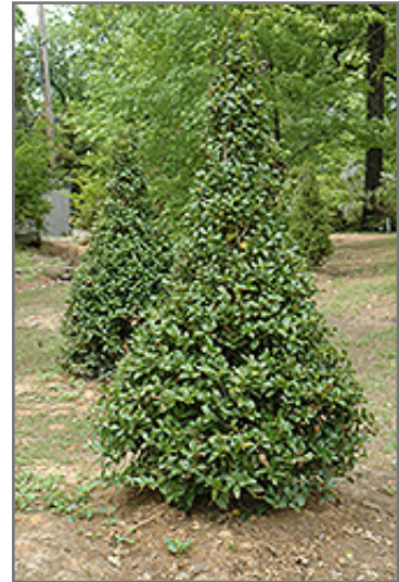
Castle Spire Meserve Holly