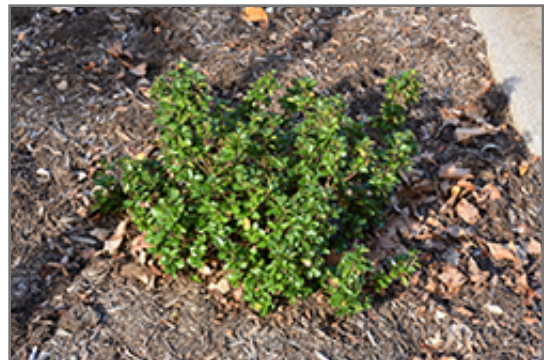
Emerald Magic Meserve Holly