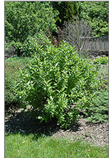
Arctic Fire Red Twig Dogwood