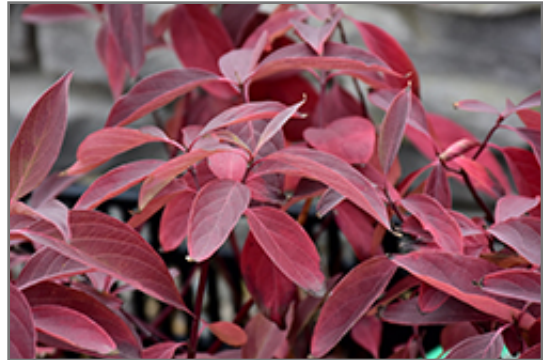
Arctic Fire Red Twig Dogwood in fall

This shrub does best in full sun to partial shade. It is an amazingly adaptable plant, tolerating both dry conditions and even some standing water. It is not particular as to soil type or pH. It is highly tolerant of urban pollution and will even thrive in inner city environments. This is a selection of a native North American species.