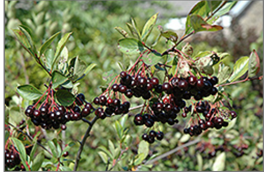
Autumn Magic Black Chokeberry fruit

This shrub should only be grown in full sunlight. It is an amazingly adaptable plant, tolerating both dry conditions and even some standing water. It is not particular as to soil type or pH, and is able to handle environmental salt. It is somewhat tolerant of urban pollution. This is a selection of a native North American species.