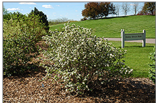
Autumn Magic Black Chokeberry in bloom