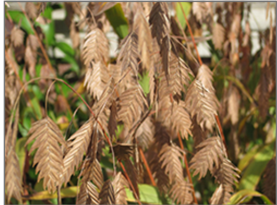
Northern Sea Oats fruit

Northern Sea Oats will grow to be about 4 feet tall at maturity, with a spread of 30 inches. Its foliage tends to remain dense right to the ground, not requiring facer plants in front. It grows at a medium rate, and under ideal conditions can be expected to live for approximately 10 years. As an herbaceous perennial, this plant will usually die back to the crown each winter, and will regrow from the base each spring. Be careful not to disturb the crown in late winter when it may not be readily seen!