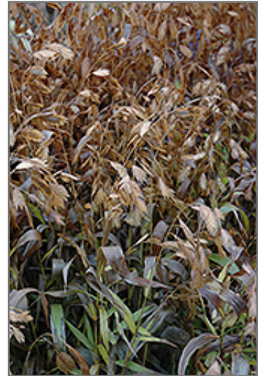
Northern Sea Oats in fall

Northern Sea Oats is recommended for the following landscape applications;