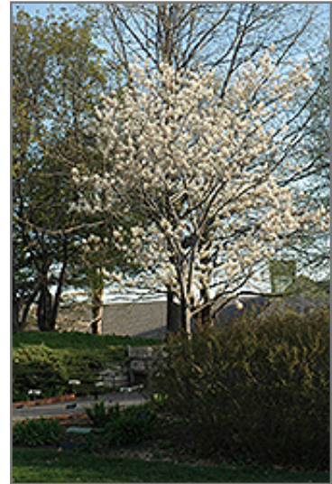
Cumulus Serviceberry in bloom