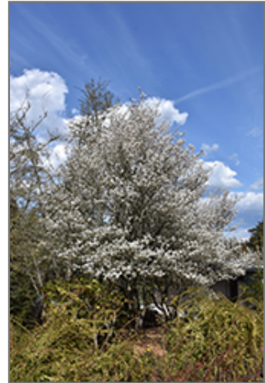
Cumulus Serviceberry in bloom

This shrub does best in full sun to partial shade. It prefers to grow in average to moist conditions, and shouldn't be allowed to dry out. It is not particular as to soil type or pH. It is somewhat tolerant of urban pollution. This is a selection of a native North American species.