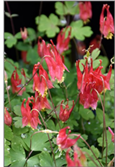
Little Lanterns Columbine flowers

Little Lanterns Columbine is a fine choice for the garden, but it is also a good selection for planting in outdoor pots and containers. It is often used as a 'filler' in the 'spiller-thriller-filler' container combination, providing a mass of flowers and foliage against which the larger thriller plants stand out. Note that when growing plants in outdoor containers and baskets, they may require more frequent waterings than they would in the yard or garden.