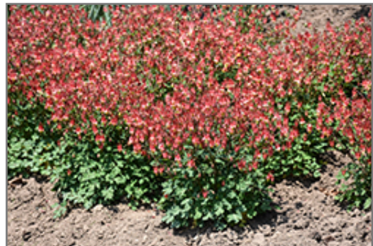
Little Lanterns Columbine in bloom