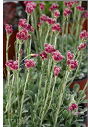
Red Pussytoes flowers

Red Pussytoes is recommended for the following landscape applications;