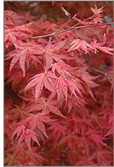
Suminagashi Japanese Maple foliage

This tree does best in full sun to partial shade. You may want to keep it away from hot, dry locations that receive direct afternoon sun or which get reflected sunlight, such as against the south side of a white wall. It prefers to grow in average to moist conditions, and shouldn't be allowed to dry out. It is not particular as to soil pH, but grows best in rich soils. It is somewhat tolerant of urban pollution, and will benefit from being planted in a relatively sheltered location. Consider applying a thick mulch around the root zone in winter to protect it in exposed locations or colder microclimates. This is a selected variety of a species not originally from North America.