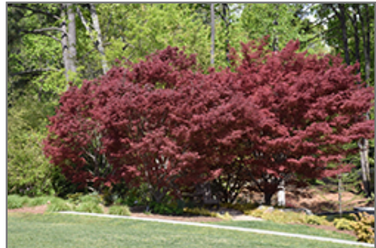
Suminagashi Japanese Maple