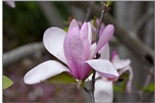
Jane Magnolia flowers

This shrub does best in full sun to partial shade. It requires an evenly moist well-drained soil for optimal growth, but will die in standing water. It is not particular as to soil type, but has a definite preference for acidic soils. It is quite intolerant of urban pollution, therefore inner city or urban streetside plantings are best avoided. Consider applying a thick mulch around the root zone in winter to protect it in exposed locations or colder microclimates. This particular variety is an interspecific hybrid.