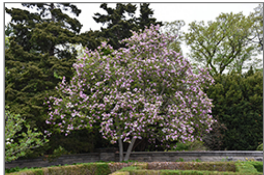
Jane Magnolia in bloom