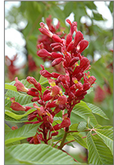
Red Buckeye flowers