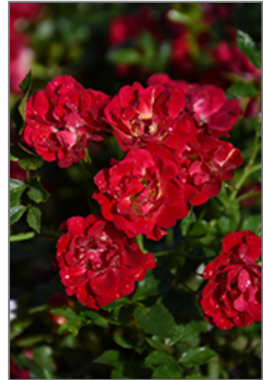
Red Drift Rose flowers

Red Drift Rose makes a fine choice for the outdoor landscape, but it is also well-suited for use in outdoor pots and containers. Because of its spreading habit of growth, it is ideally suited for use as a 'spiller' in the 'spiller-thriller-filler' container combination; plant it near the edges where it can spill gracefully over the pot. Note that when grown in a container, it may not perform exactly as indicated on the tag - this is to be expected. Also note that when growing plants in outdoor containers and baskets, they may require more frequent waterings than they would in the yard or garden.