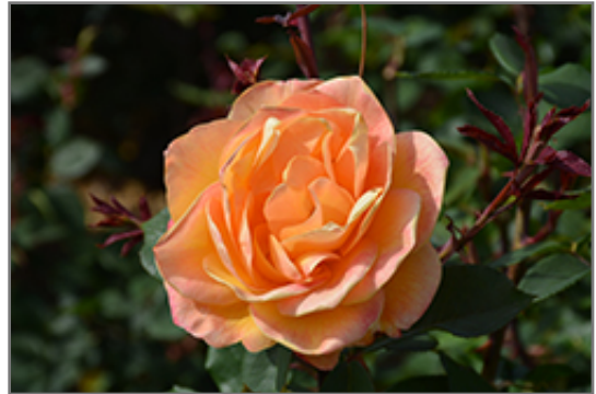
Strike It Rich Rose flowers