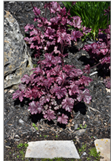
Midnight Rose Coral Bells