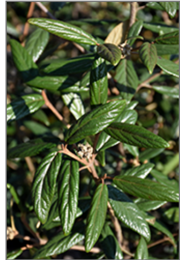
Prague Viburnum foliage

This shrub does best in full sun to partial shade. It prefers to grow in average to moist conditions, and shouldn't be allowed to dry out. It is not particular as to soil type or pH. It is highly tolerant of urban pollution and will even thrive in inner city environments. This particular variety is an interspecific hybrid.