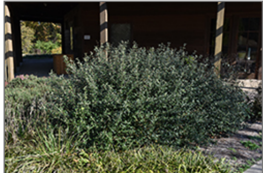
Prague Viburnum