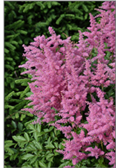
Visions in Pink Chinese Astilbe flowers

Visions in Pink Chinese Astilbe is recommended for the following landscape applications;