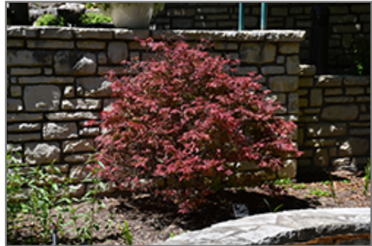
Shaina Japanese Maple

Shaina Japanese Maple is recommended for the following landscape applications;