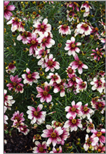
Sizzle And SpiceZesty Zinger Tickseed flowers

Sizzle And SpiceZesty Zinger Tickseed is recommended for the following landscape applications;