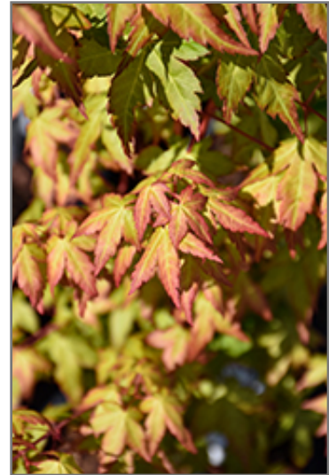
Bihou Japanese Maple foliage