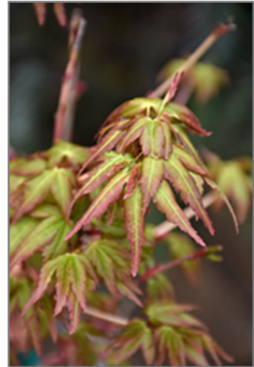
Bihou Japanese Maple foliage