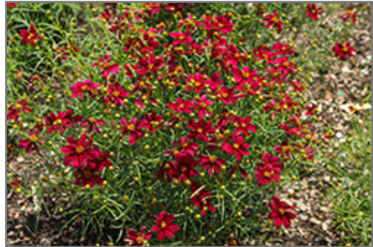
Designer Threads Scarlet Ribbons Tickseed flowers

Designer Threads Scarlet Ribbons Tickseed is recommended for the following landscape applications;