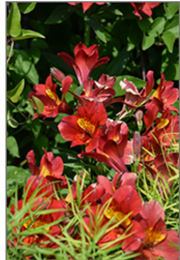
Summer Heat Alstroemeria flowers