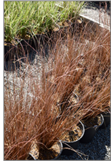
Firefox Leatherleaf Sedge

Firefox Leatherleaf Sedge is a fine choice for the garden, but it is also a good selection for planting in outdoor pots and containers. It can be used either as 'filler' or as a 'thriller' in the 'spiller-thriller-filler' container combination, depending on the height and form of the other plants used in the container planting. It is even sizeable enough that it can be grown alone in a suitable container. Note that when growing plants in outdoor containers and baskets, they may require more frequent waterings than they would in the yard or garden.