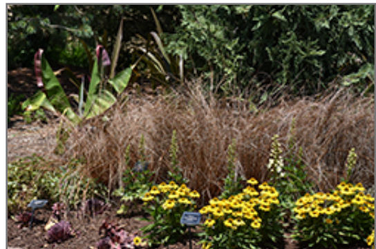
Firefox Leatherleaf Sedge