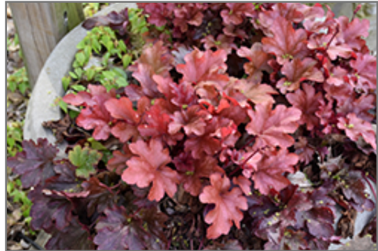
Peach Flambe Coral Bells

Peach Flambe Coral Bells is a fine choice for the garden, but it is also a good selection for planting in outdoor pots and containers. It is often used as a 'filler' in the 'spiller-thriller-filler' container combination, providing a mass of flowers and foliage against which the larger thriller plants stand out. Note that when growing plants in outdoor containers and baskets, they may require more frequent waterings than they would in the yard or garden.