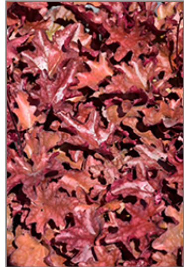
Peach Flambe Coral Bells foliage

This is a relatively low maintenance plant, and should be cut back in late fall in preparation for winter. It is a good choice for attracting hummingbirds to your yard. It has no significant negative characteristics.