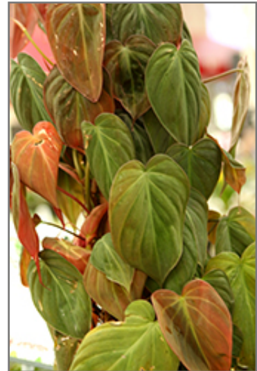
Velvet Leaf Philodendron foliage