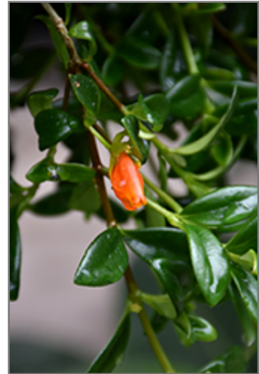
Goldfish Plant flowers

This is a dense herbaceous evergreen houseplant with a trailing habit of growth, eventually spilling over the edges of hanging baskets and containers. This plant can be pruned at any time to keep it looking its best.