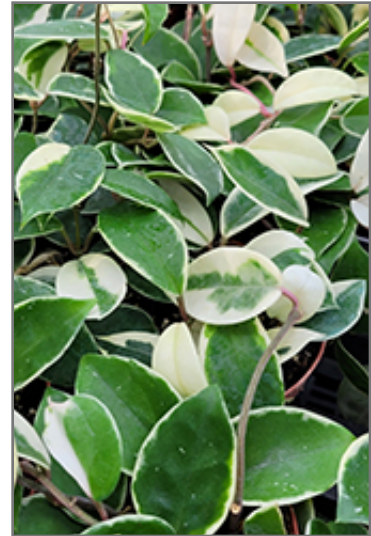
Krimson Queen Wax Plant foliage

This is an herbaceous houseplant with a spreading, ground-hugging habit of growth. This plant may benefit from an occasional pruning to look its best.