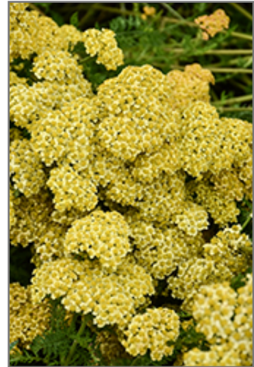
Milly Rock Yellow Terracotta Yarrow flowers