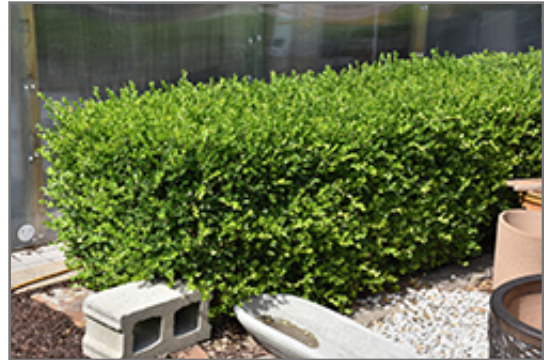
NewGen Independence Boxwood

NewGen Independence Boxwood is recommended for the following landscape applications;