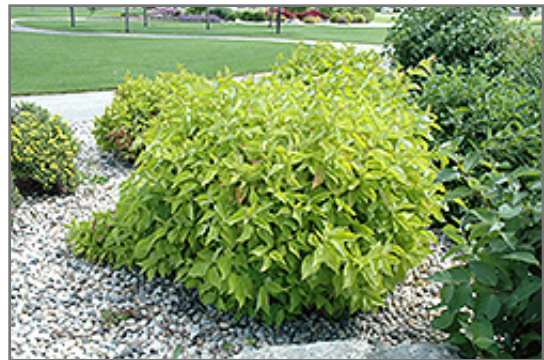
Prairie Fire Dogwood