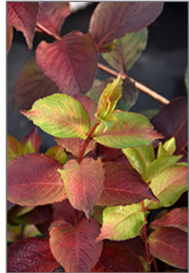
Midnight Sun Reblooming Weigela foliage