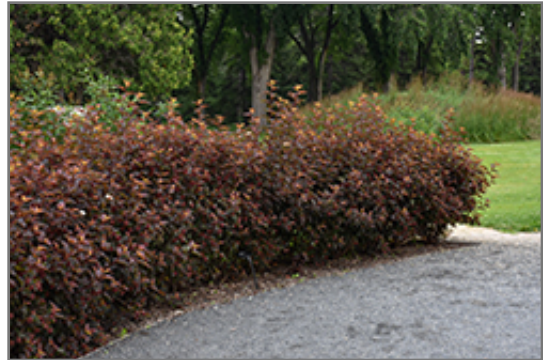
Center Glow Ninebark

This shrub does best in full sun to partial shade. It is very adaptable to both dry and moist locations, and should do just fine under average home landscape conditions. It is not particular as to soil type or pH. It is highly tolerant of urban pollution and will even thrive in inner city environments. This is a selection of a native North American species.