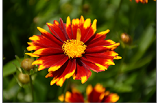
UpTick Red Tickseed flowers

UpTick Red Tickseed will grow to be about 12 inches tall at maturity, with a spread of 14 inches. Its foliage tends to remain dense right to the ground, not requiring facer plants in front. It grows at a medium rate, and under ideal conditions can be expected to live for approximately 10 years. As an herbaceous perennial, this plant will usually die back to the crown each winter, and will regrow from the base each spring. Be careful not to disturb the crown in late winter when it may not be readily seen!