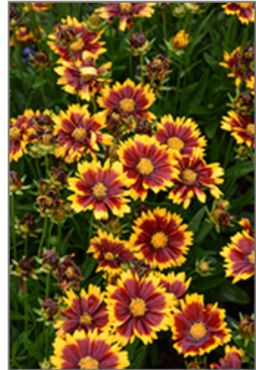
UpTick Red Tickseed flowers

UpTick Red Tickseed is recommended for the following landscape applications;