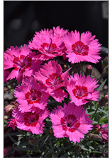
Paint The Town Fancy Pinks flowers

Paint The Town Fancy Pinks is a fine choice for the garden, but it is also a good selection for planting in outdoor pots and containers. It is often used as a 'filler' in the 'spiller-thriller-filler' container combination, providing a mass of flowers and foliage against which the thriller plants stand out. Note that when growing plants in outdoor containers and baskets, they may require more frequent waterings than they would in the yard or garden.