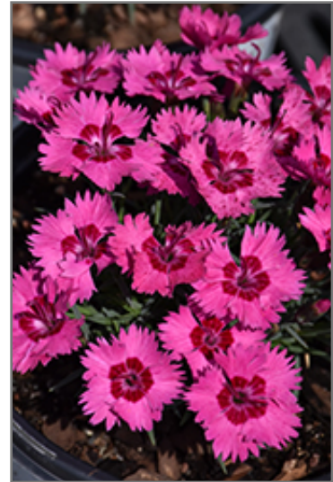
Paint The Town Fancy Pinks flowers

This is a relatively low maintenance plant, and is best cleaned up in early spring before it resumes active growth for the season. It is a good choice for attracting bees and butterflies to your yard, but is not particularly attractive to deer who tend to leave it alone in favor of tastier treats. It has no significant negative characteristics.