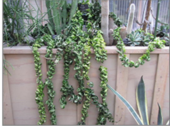
Hindu Rope Plant

When grown indoors, Hindu Rope Plant can be expected to grow to be about 12 inches tall at maturity, with a spread of 3 feet. It grows at a medium rate, and under ideal conditions can be expected to live for approximately 10 years. This houseplant should be situated in a location that gets indirect sunlight at most, although it will usually require a more brightly-lit environment than what artificial indoor lighting alone can provide. It is very adaptable to both dry and moist soil, but will not tolerate any standing water. The surface of the soil shouldn't be allowed to dry out completely, and so you should expect to water this plant once and possibly even twice each week. Be aware that your particular watering schedule may vary depending on its location in the room, the pot size, plant size and other conditions; if in doubt, ask one of our experts in the store for advice. It is particular about its soil conditions, with a strong preference for rich, acidic soil. Contact the store for specific recommendations on pre-mixed potting soil for this plant.