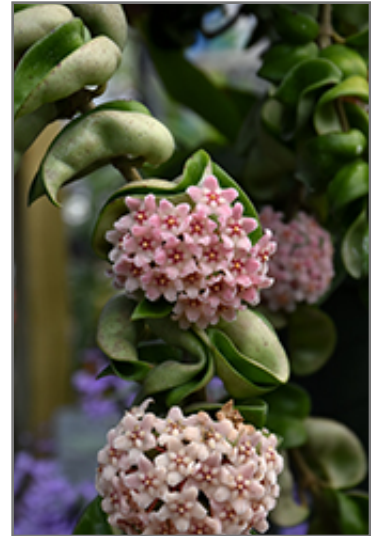
Hindu Rope Plant flowers

This is an herbaceous houseplant with a spreading, ground-hugging habit of growth. This plant usually looks its best without pruning, although it will tolerate pruning.