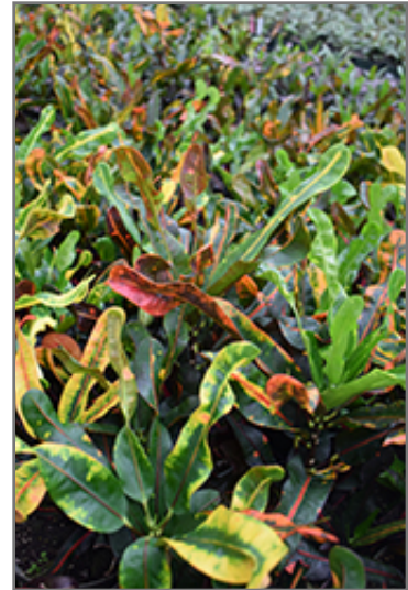
Mammy Croton in full

This is a dense herbaceous evergreen houseplant with an upright spreading habit of growth. Its wonderfully bold, coarse texture is quite ornamental and should be used to full effect. This plant should not require much pruning, except when necessary to keep it looking its best.