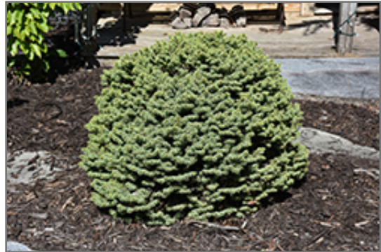
Dwarf Serbian Spruce