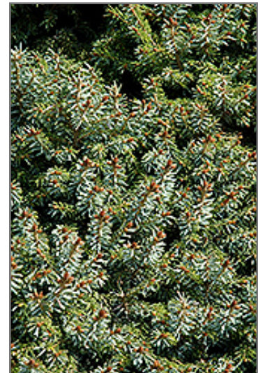
Dwarf Serbian Spruce foliage