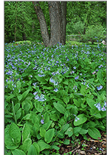
Virginia Bluebells in bloom